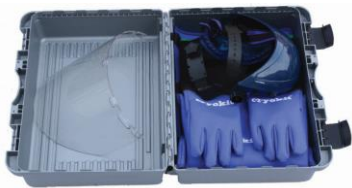
Cryogenic safety equipment