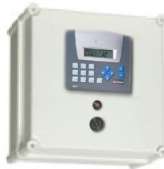
O2 depletion alarm